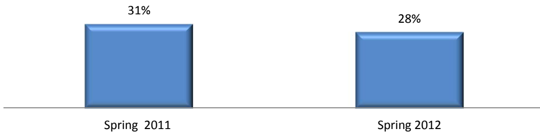
Figure 2. Persistence Rates of English 43 Students Enrolled in English 49